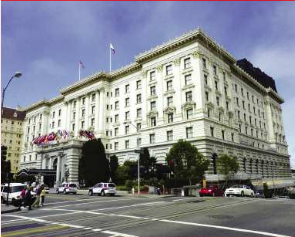
THE FAIRMONT HOTEL: VENUE FOR THE FIRST EVER PERFORMANCE BY TONY BENNETT OF 'I LEFT MY HEART IN SAN FRANCISCO' IN 1961. AND VENUE FOR INSOL IN 2015.