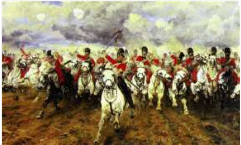
IT IS NEARLY 200 YEARS SINCE THE CHARGE OF THE ROYAL SCOTS GREYS AT WATERLOO

So what do we have for you in this edition of the Digest? As usual there are a number of