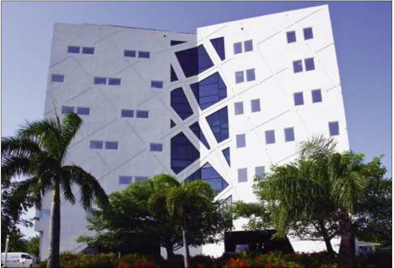
WALKERS HEADQUARTERS CAYMAN ISLANDS

examined. All communications between the instructing parties and the experts will be disclosable in order to ensure transparency of communications with experts. The valuation process imposed by the Court is not intended to be particularly adversarial. The process is intended to be efficient and assist the Court with making a properly informed decision as to the value of the shareholder's proportionate share of the business as a going concern.