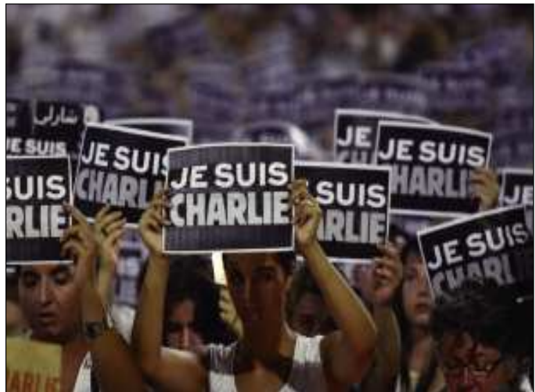
JE SUIS CHARLIE: ADOPTED BY DEMONSTRATORS AS A SYMBOL OF SOLIDARITY

The end of 2014 and the start of 2015 have seen some pretty big events. The appalling things that happened in Paris at the start of the year, with the attacks by three gunmen at Charlie Hebdo and a supermarket in Vincennes, and which led to the subsequent proliferation of the solidarity phrase “Je Suis Charlie”. The dramatic fall in the oil price (in June 2014 Brent crude was $115 a barrel – by January 2015 it had plunged by more than half). The rate of inflation in the UK plummeting to its lowest level on record (the CPI rate in December 2014 was 0.5 per cent). The electricity companies cutting their prices (well, sort of, with cuts of about 5 per cent, although consumer groups say that the cuts should be 10 per cent). The massive fall in the value of the Rouble (hit by the drop in the oil price and western sanctions). The start of QE in the Eurozone – they are effectively going to print something like Euros 1 trillion. Victory in the Greek elections for the anti-austerity party,