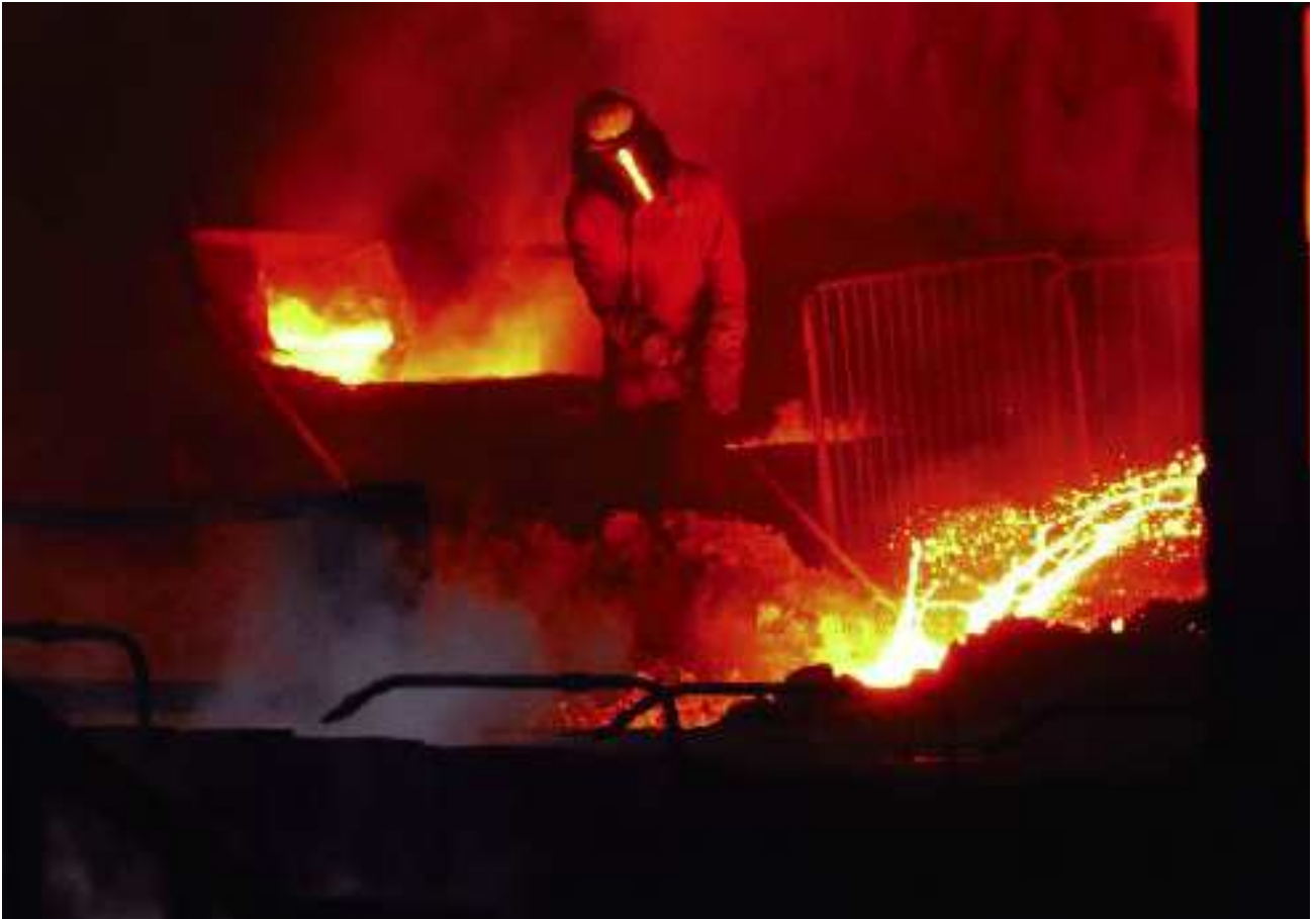
LICTOR ANSTALT: TROUBLE AT T'MILL...

Further, it argued that a defence of justification was available where the hive-down of assets, including the equipment to Mir and the sale of Mir to Libala, was in pursuance of an exercise by the administrators of their statutory powers and functions to realise the assets of Alphasteel to the best advantage of creditors.