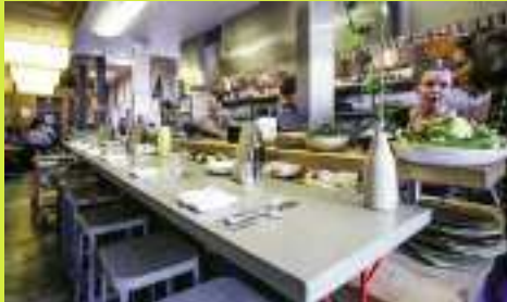
STATE BIRD PROVISIONS

State Bird Provisions: Modern American, Fillmore Street www.statebirdsf.com