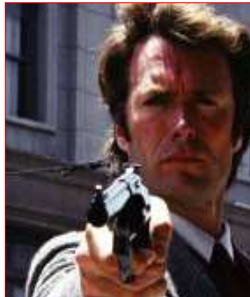
A FAMOUS SON