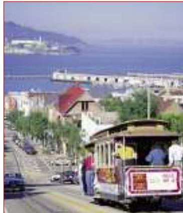
SAN FRANCISCO CABLE CARS

Press Club: Wine bar and lounge, near Union Square www.pressclubsf.com