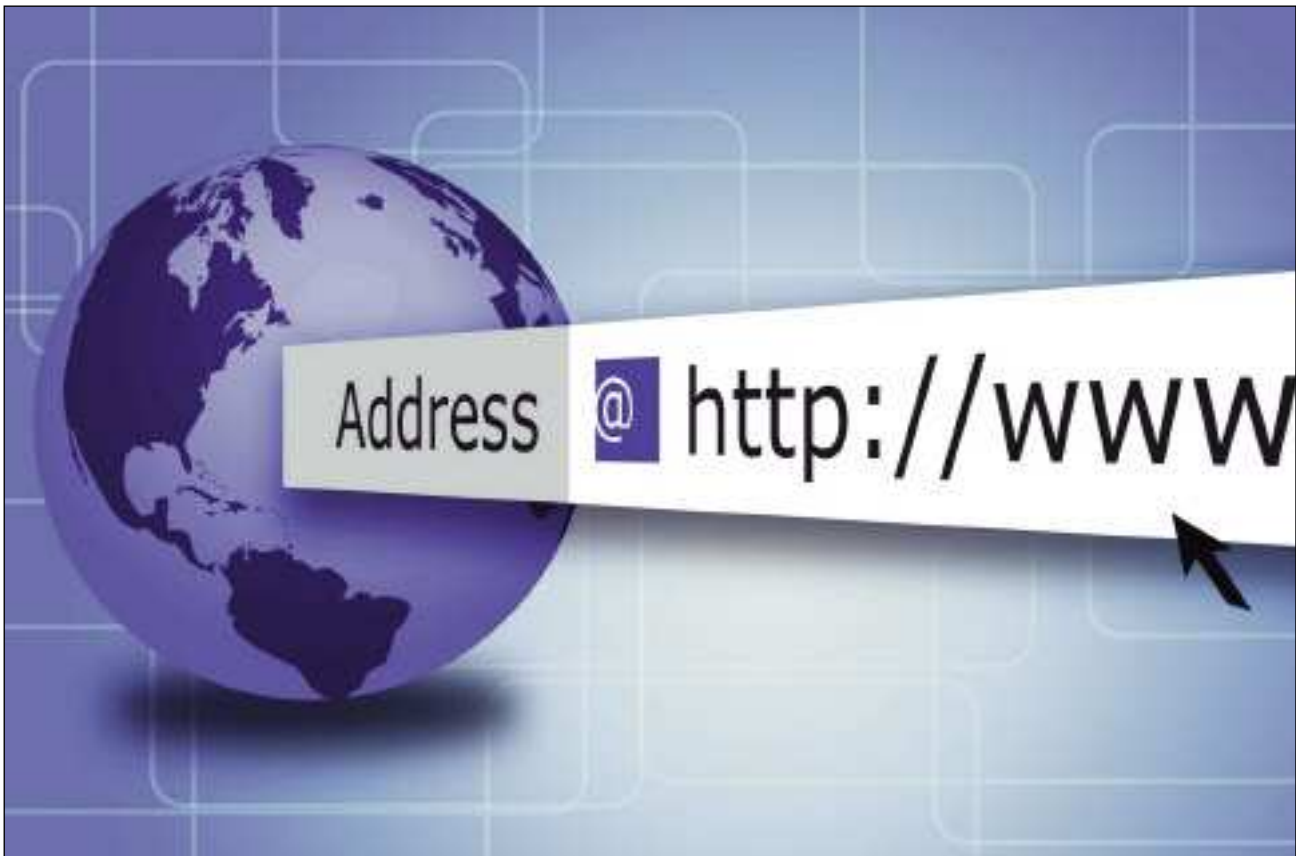
IF THE BUSINESS ISN'T MARKETED VIA THE INTERNET, THIS SHOULD BE JUSTIFIED BY THE ADMINISTRATOR TO CREDITORS

sit within an insolvent company. Experience has shown that these types of assets will attract their own (often vibrant) market interest, notwithstanding 'being told' by some their value has diminished.