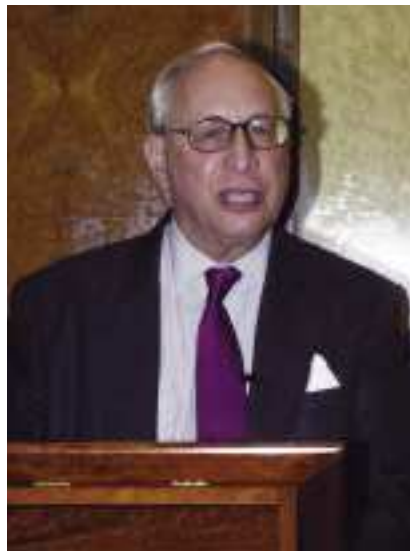
LORD MILLETT, WHO AS MILLET J, DECIDED RE CHARNLEY DAVIS LTD

The duty to take care is not absolute but only to take reasonable care. An Administrator is not under any absolute duty to obtain the best price but "the best price in the circumstances as the Administrator