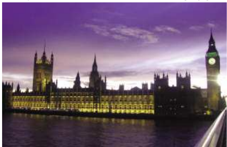
THE GOVERNMENT ACCEPTED ALL RECOMMENDATIONS IN THE GRAHAM REPORT

person who is or has been or purports to be the Administrator of a company where there has been a breach of a fiduciary or other duty in relation to a company and, that the company has suffered a loss as a result. An examination under this paragraph