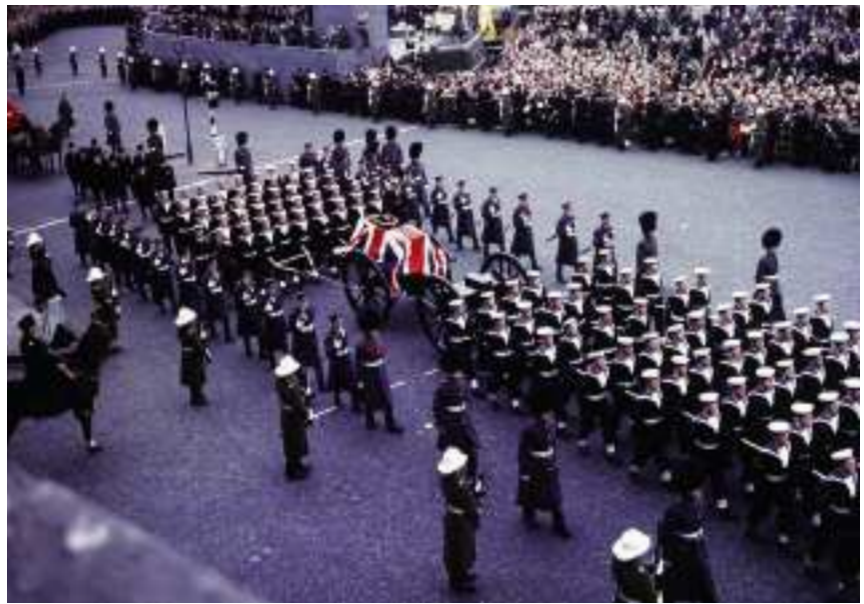
CHURCHILL'S FUNERAL: ONE OF MANY SIGNIFICANT ANNIVERSARIES IN 2015

15 years ago Ken Livingstone became the first modern Mayor of London (4 May 2000). And it is 10 years since the 7/7 bombings (7 July 2005).