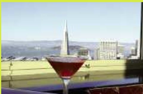
TOP OF THE MARK

Top of the Mark: Bar with 360 panoramic view located on 19 th floor of the InterContinental Mark Hopkins www.intercontinentalmarkhopkins.com/top-of-the-mark.aspx