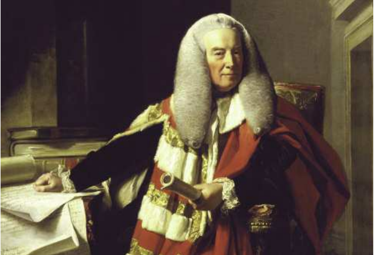
LORD MANSFIELD HELD THAT PREFERENCES WERE VOID AT COMMON LAW

and rationale of these two principles. The basis of such assistance is the principle of modified universalism, which enables the Court to provide (on a discretionary basis) support to foreign insolvency proceedings that are being conducted under a foreign statutory insolvency scheme. The reasoning of the majority in Singularis makes clear that the mere fact that the insolvency proceedings are being conducted under a foreign statutory scheme cannot be raised as an objection to the exercise of a common law power.