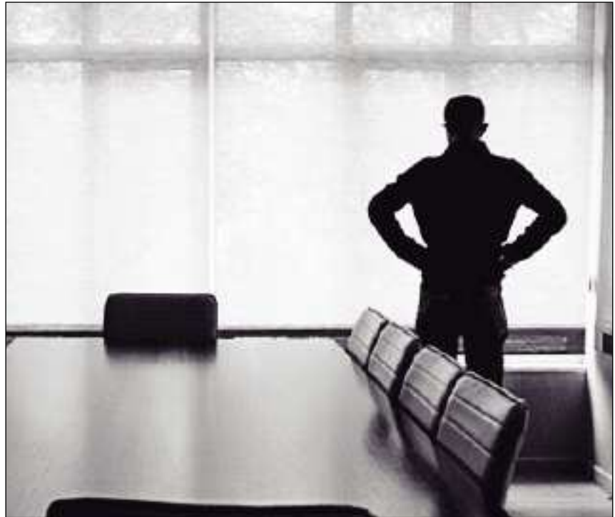
WHAT GUIDANCE IS THERE FOR DIRECTORS FROM RECENT DECISIONS?

So far the English courts have adopted the Colin Gwyer approach. As the company was found to be actually insolvent in that case, the statement that the interests of creditors are paramount when it the company is on the verge of insolvency was strictly obiter . Nevertheless, this statement has been cited with apparent approval on a number of