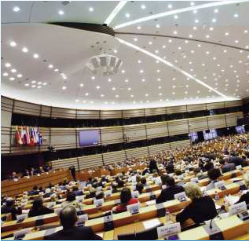
THE EUROPEAN COUNCIL AND THE EUROPEAN PARLIAMENT HAVE REACHED A 'POLITICAL AGREEMENT' IN RELATION TO THE PROPOSED AMENDMENTS TO THE REGULATION ON INSOLVENCY PROCEEDINGS

The agreed new text of Article 3 for the first time provides a presumption in the case of individuals exercising an independent business or professional activity. The presumption here will be that the COMI is the individual's principal place of business. Once again this presumption will only apply if the principal place of business has not been moved to a different Member State within a period of three months prior to the request for the opening of insolvency proceedings.