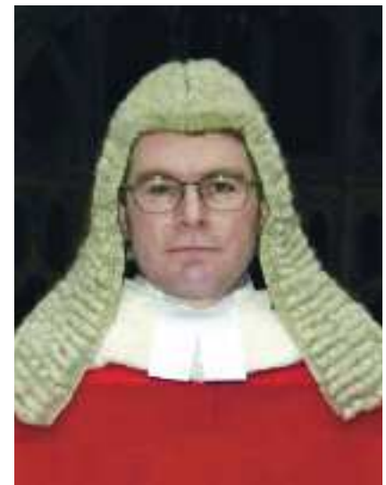
MR JUSTICE MANN DIDN'T LIKE THE MONTE CARLO VALUATION TECHNIQUE

value' will be important as in most pre-packs one would be looking at the sale of a going concern rather than a break up sale of its individual assets. Where a business has reached the end of its economic life, its break up value may well be greater than its enterprise value.