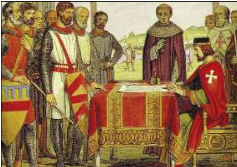
KING JOHN SIGNED THE MAGNA CARTA AT RUNNYMEDE 800 YEARS AGO THIS JUNE, BUT NOT WITH A QUILL PEN...